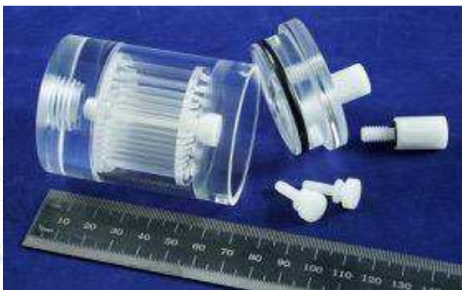
Components of Micro Deluxe Phantom™