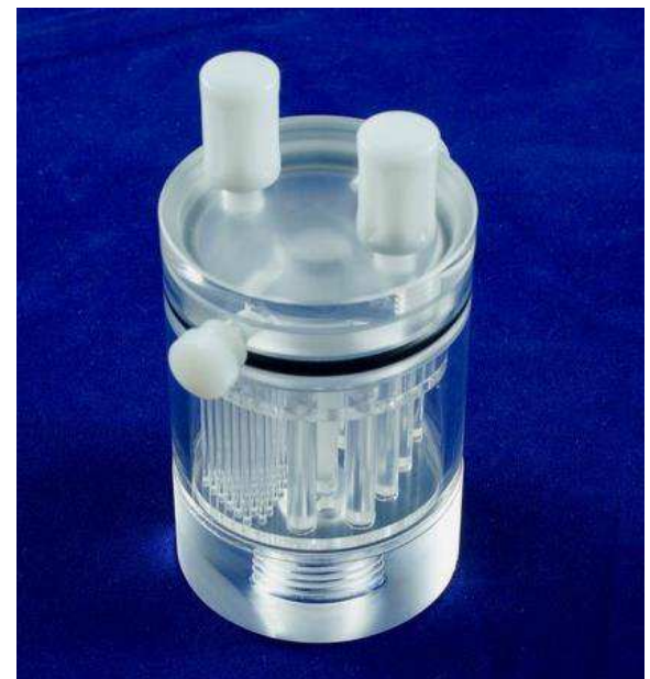
Micro Deluxe Phantom™